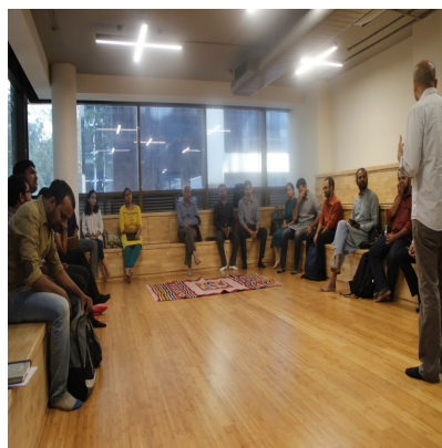
APPROPRIATE TECHNOLOGY IN HEALTH - AN EXPLORATORY WORKSHOP Read More