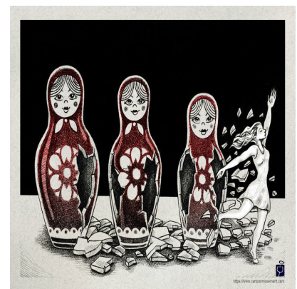
Hollowed by thy shadow Poem