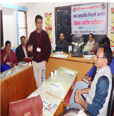
Community action for health - Chhatarpur District in MP Read More